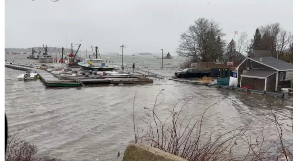
Commercial Fish Pier submerged during January 10 storm.